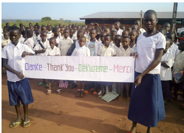
Sign of gratitude for free school lessons.

Chapter 6 gives insight into the biggest miracle of all: True love, with examples that offer encouragement and hope. Various attributes of this virtue are presented, and in conclusion, the author explains how, in his opinion, the highest form of love can be received.