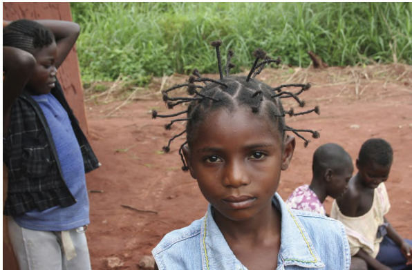
Girl with a unique, pretty hairstyle.

Chapter 4 opens a new perspective on life. The spiritual side of life is addressed, the sphere where real love and faith exist – two important keys to solving both global and personal problems.