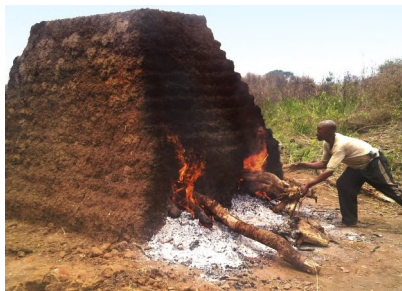
Kiln to burn bricks for our school.