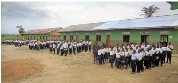
Nearly 300 children attend our ITAV ADH Mabala Agro-Veterinary high school free of charge.

This book attempts to inspire all people to work together for the good of humanity. It encourages everyone to unite around the common goal of transforming the world through loving actions and mutual help.